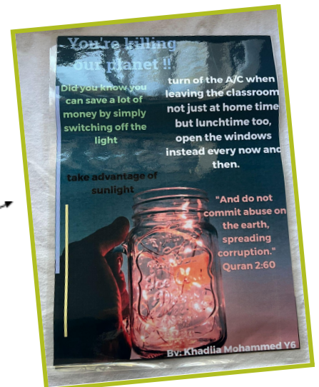
Poster created by Khadija in Y6