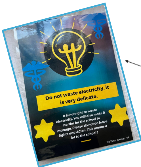
Poster created by Umar in Y4